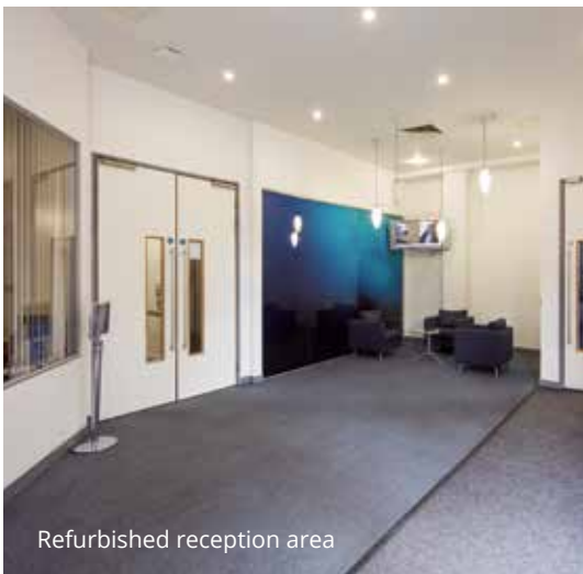
Refurbished reception area