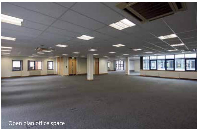
Open plan office space